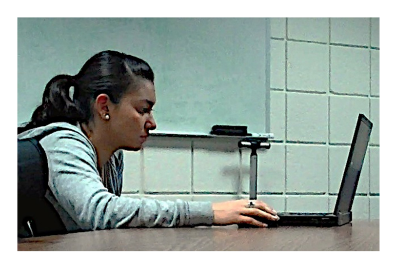
Figure 2. Student Working on a Glogster

Nonetheless, he created it over again, even though the researcher told him he did not have to rewrite it. He said, "It is something fun to do." All students said they enjoyed making Glogsters, which required students to read, write, listen, and speak, which are areas that English learners need to build.