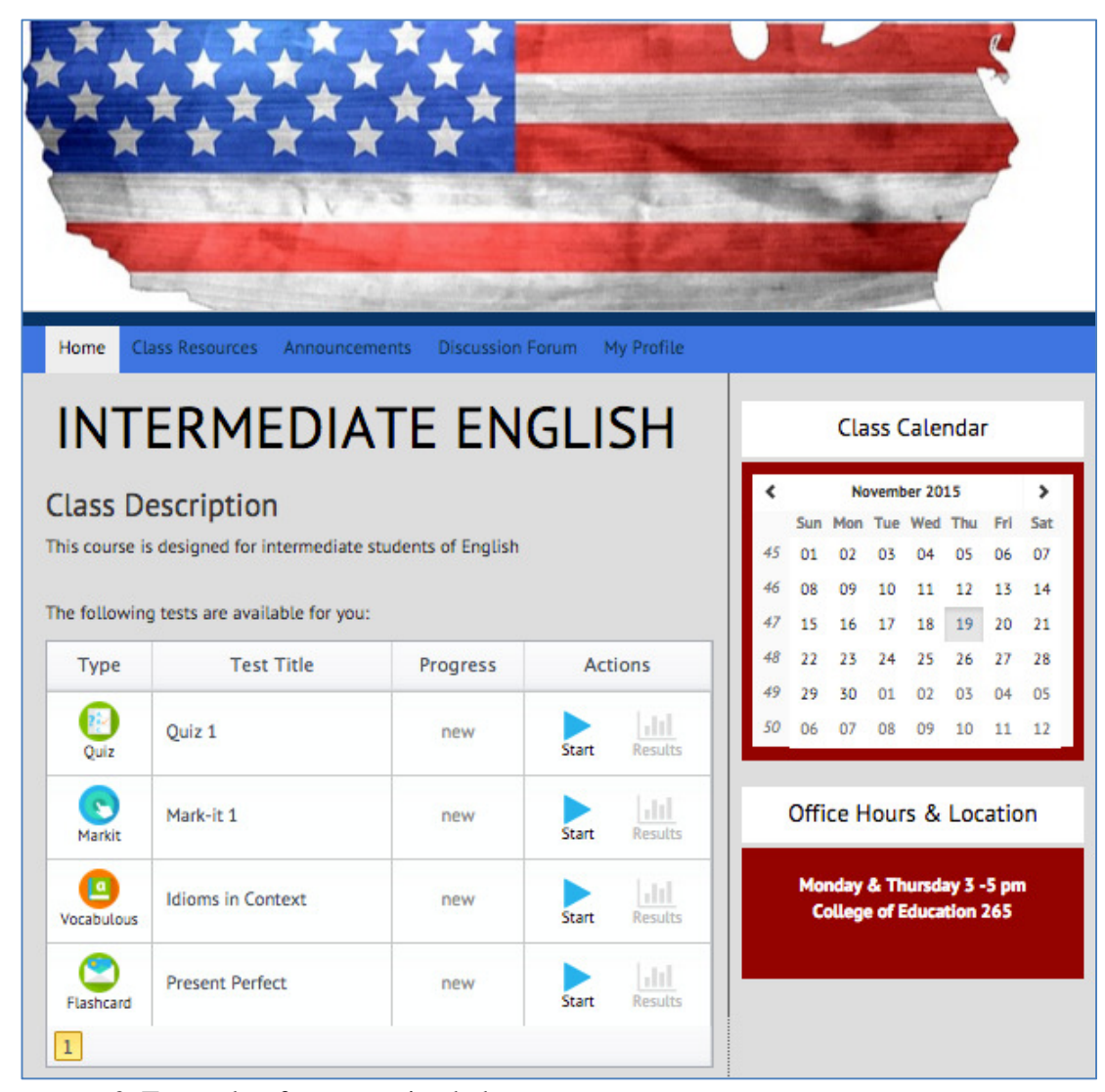
Figure 2. Example of a customized class

To start developing a class, the instructor navigates to the dashboard and clicks on "Create class," which prompts the user to all previously created classes and to the option to create or upload a new class. To create quizzes or other tasks, the instructor clicks on the respective button on the dashboard. Documents that the user wishes to make available for a class (e.g., a syllabus or handouts) need to be uploaded to the document storage, also found on the dashboard. The class and task sites follow the same design principles, which facilitates usage. Tasks can be edited, previewed, and printed, and quizzes can also be analyzed. Instructors can modify several quiz settings (e.g., time limit, trials, show results, or show answers) and choose from a variety of questions, e.g., true/false, multiple answer, matching, free response. Once the quizzes and other tasks are created, they can then be uploaded into a class.